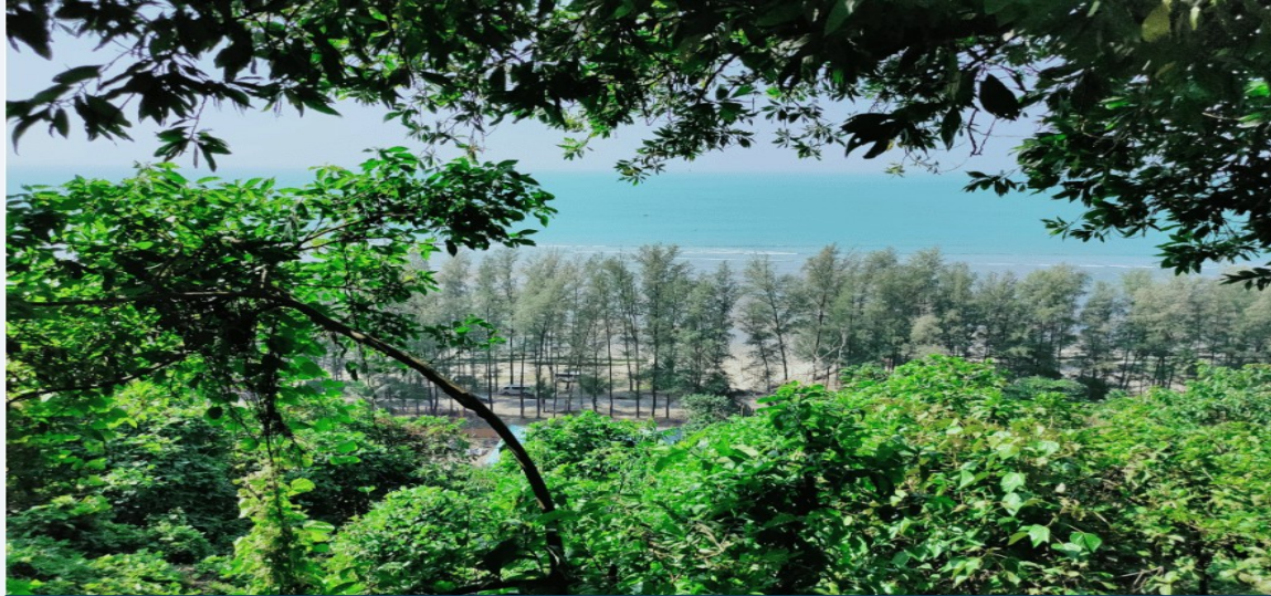
Himchari National Park

🕒 6:30 AM — Watched the sunrise 📷 The calm morning felt magical and peaceful.