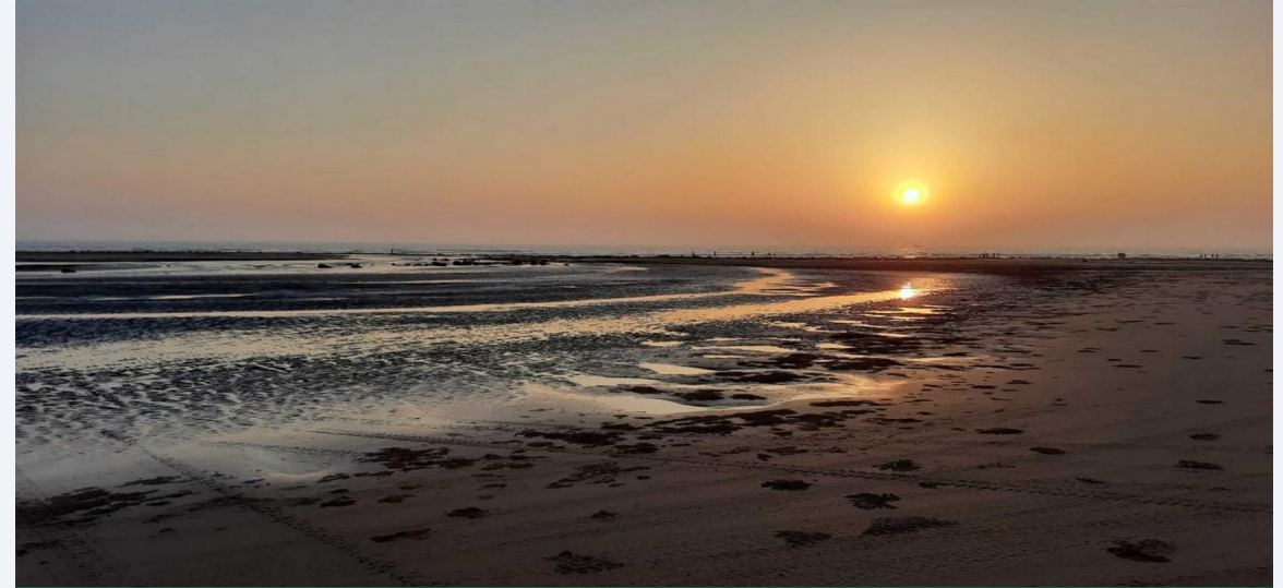
📷 Inani Beach

🕒 11:00 AM — Reached the hilltop! "The view of the sea and green hills together was simply amazing!"