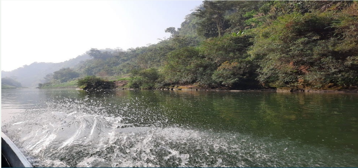
Journey to Remakri by Boat